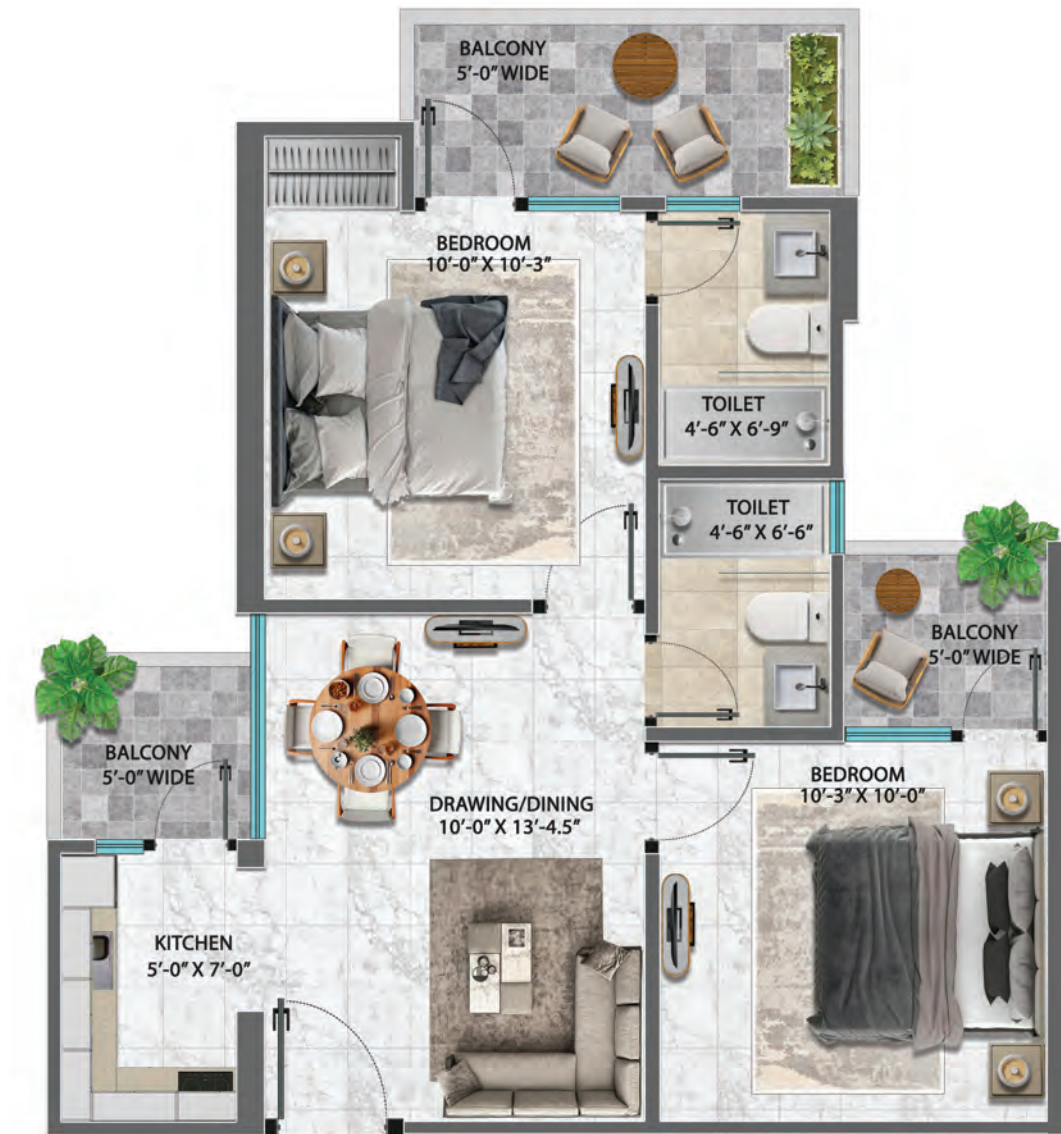
TYPE 2A (2BHK + 2 Toilets)